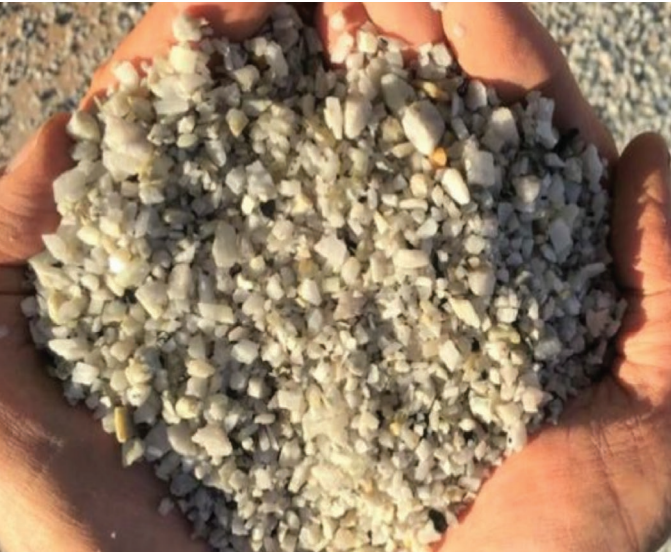
Figure 1: Spodumene Mining Operations