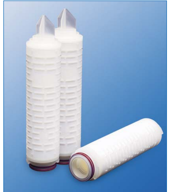
Pall MEMBRACart XL II Filter Cartridges

Filtration technology that enables spore removal from the ingredients or from beverages is an ideal solution for this challenge.