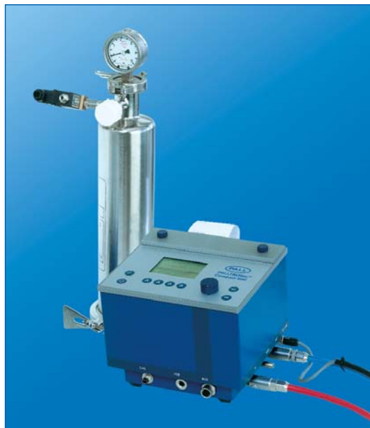
◀ Figure 2: Palltronic Compact Star is a simple to use, portable test device used to monitor and document filter integrity.