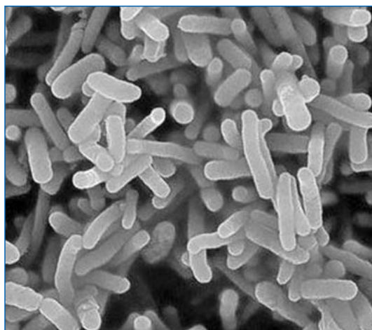
◀ Figure 1: Alicyclobacillus species are gram positive, thermoacidophilic spore-forming bacteria which cause serious economic damage for beverage producers.

To confirm membrane filter performance, a Palltronic Compact Star filter integrity test instrument is used both prior to and after completion of each filtration batch (Figure 2). The Pall Compact Star is a simple to use, portable device based on the principle of pressure decay integrity test. Results can be printed or downloaded to supplement Quality Assurance records.