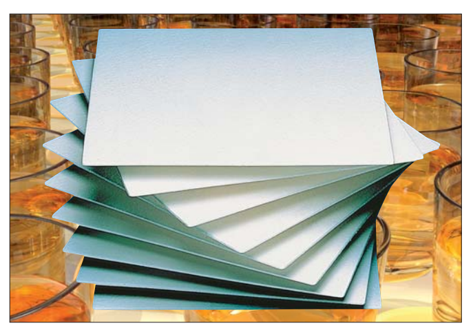
Seitz IR Series Filter Sheets