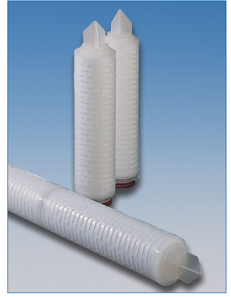
Figure 2: Emflon PFW cartridges are designed for sterilization of large volume gases in compact installations.