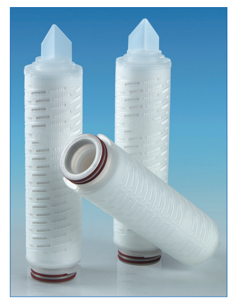
Figure 1: Emflon HTPFRW cartridges provide sterilization of high temperature gases and and can be considered for use in oxygen-enriched air applications.

Pall's Emflon filter family offers a variety of solutions for addressing microbial removal in air and gas applications. Please contact Pall for further information.