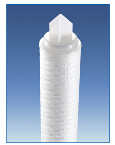
Figure 3: Emflon PFAW cartridges offer exceptionally high flow rates and are used for less critical bioburden reduction in gases.