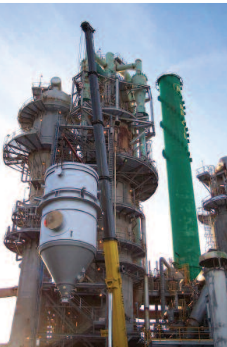
Fig 5: Filter vessel lifted into position