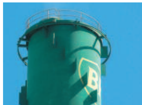
Fig 2: R1 & R2 common stack

In Europe many countries have now legislated for or are moving towards legislating for 50 mg/Nm 3 emissions in the FCCU/RCCU flue gas. Furthermore, some countries have already decided to reduce those emission targets further to less than 40 mg/Nm 3 . Another environmental regulation which will be even more stringent is the proposed microparticulate specification relating to particles below 10 microns and 2.5 microns (so called PM 10 and PM 2.5 respectively). This is currently under discussion and is likely to