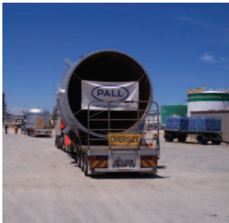
Fig 4: Filter vessels arrive on site at BP Kwinana, Perth, Western Australia