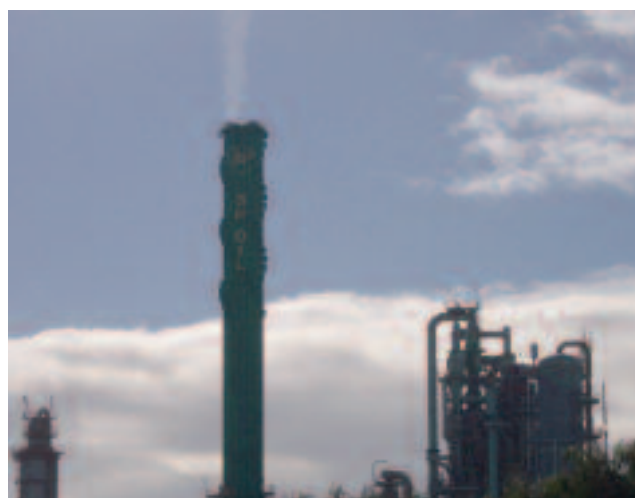
Fig 8: BP RCCU common stack before and after blowback filter start up. (Note: 2 plumes on left hand photo, and 1 plume on right hand side photo).