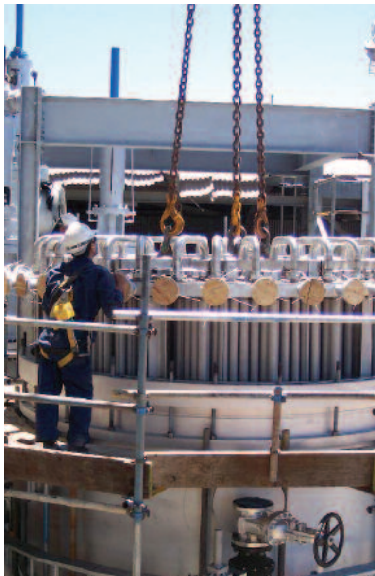
Fig 6: Filter tubesheet assembly installation

Installation of piping tie-ins was conducted during BP Kwinana's major RCCU turnaround in May-June 2004. Pre-Commissioning services were conducted over a 2 week period in early-mid June. The filter was bought on-line on June 16th 2004.