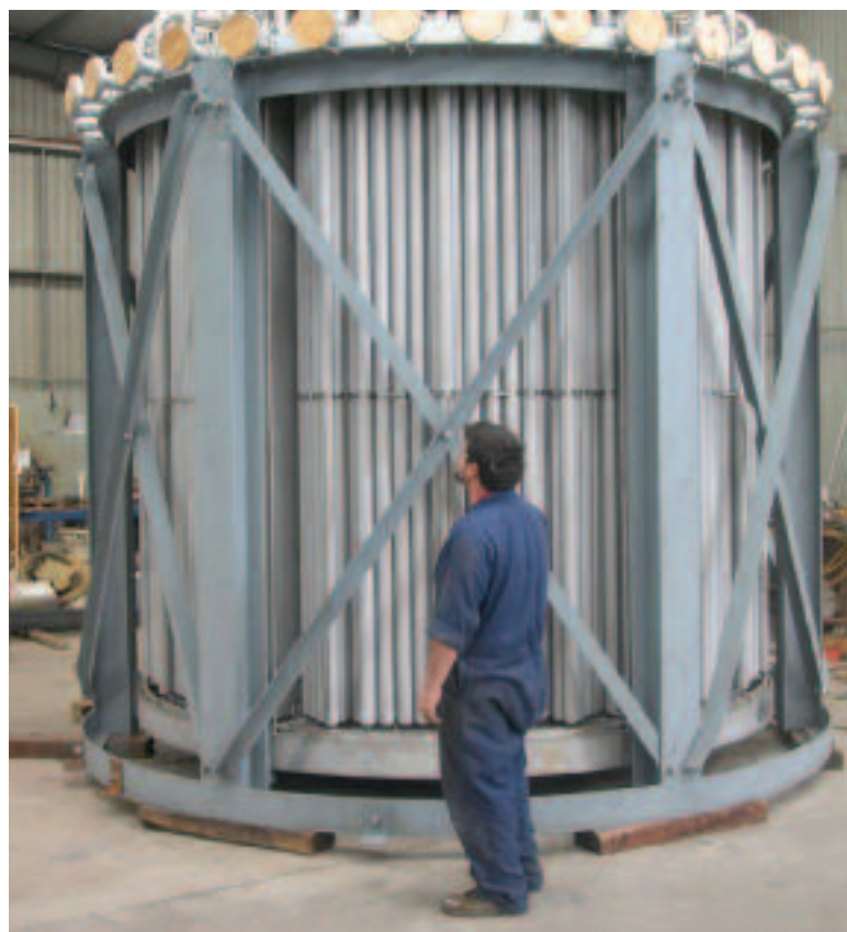
Fig 3: Tubeshheet assembly ready for shipment

The filter system was also designed with the capacity for expansion for possible future RCCU debottlenecking. The filter system was delivered after a fast-track 10 month design and fabrication period.