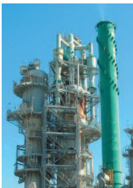
Fig 1: external cyclones BP Kwinana RCCU R2 regenerator

Around the world, for environmental reasons, oil refineries equipped with a FCCU or RCCU have to face the challenge of particulate emission reduction.