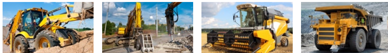
Maximum protection for mobile equipment