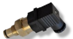
Electrical \Delta P Indicator