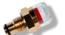
Mechanical \Delta P Indicator